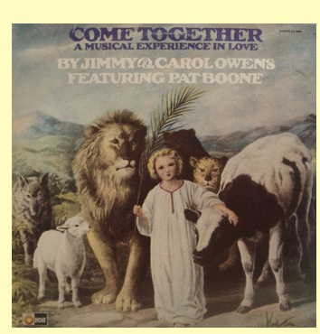
"Come Together" Album Cover

All power is given in Jesus' name In earth and heaven in Jesus' name And in Jesus' name I come to you To share His power as He told me to