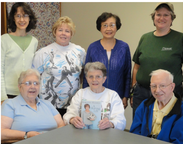
Members of the Faithful Readers Group