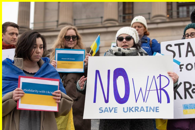
Members of the Ukrainian community and supporters gather for a peace vigil on the steps of the Tennessee State Capitol in Nashville on Feb. 25.

We all want to be safe. But our security is not in force. Spare us the ravages of war. Teach us the ways of peace.